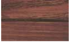
118 Dark Mahogany