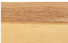
137 White Oak*