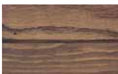
125 Black Walnut*

145 Tint Base 169 Low VOC Tint Base Available for custom coloring.