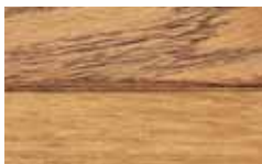
138 Spanish Oak