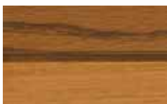
128 Early American