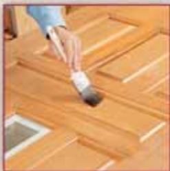
Apply ZAR® Polyurethane to grained steel door

Allow final polyurethane coat to dry depending on drying conditions, before using the door.