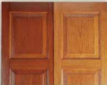
Dark Color Tone/Light Color Tone

Allow to dry 24 hours, depending on drying conditions, before applying ZAR® Polyurethane.