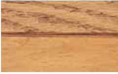
110 Salem Maple