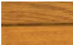
129 Amber Varnish