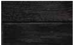
121 Black Onyx