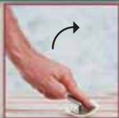
Then up, consistently,