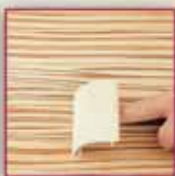
Quarter Sawn Grain