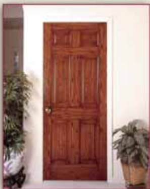
Steel door grained with ZAR® Wood Stain

You can control the darkness of the door by the amount of stain you apply. A thin coat will reveal more of the grain pattern, a heavier coat will hide it.