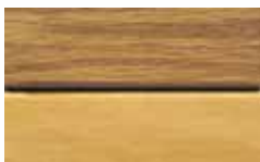
127 Golden Oak