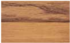
120 Teak Natural