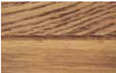
115 Modern Walnut