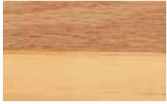
117 Honey Maple