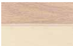
139 Coastal Boards