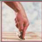
until section is complete.

Heartwood Grain: Stir ZAR® Wood Stain thoroughly. Begin on the inside of panel (1) according to the Staining Procedure Diagram. Wipe on a thin, uniform coat of ZAR® Wood Stain.