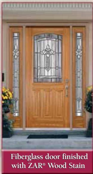
Fiberglass door finished with ZAR® Wood Stain