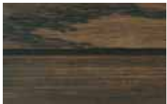
123 Moorish Teak

These chips have been reproduced as accurately as possible in process color lithography.