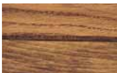
109 Colonial Pine*