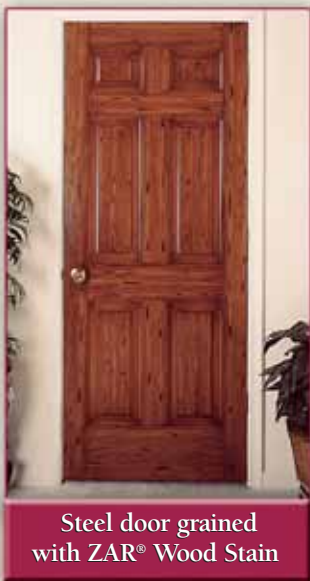
Steel door grained with ZAR® Wood Stain

Please Note: The stain application directions in this brochure may differ from the instructions on the label of the ZAR® wood finishing product you are using. Please follow the directions in this brochure since they specifically refer to finishing doors.