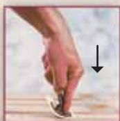
Exert downward pressure