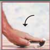
Slowly rock down ...