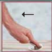
While drawing toward you