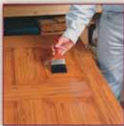
Apply ZAR® Polyurethane to grained steel door

Use a quality natural or synthetic bristle brush, depending on the type of clear finish you choose. Dip the brush in the can and let excess drip off. Apply a thin, uniform coat by flowing ZAR® on in the direction of the grain pattern. Do not brush the finish back and forth; doing so may create bubbles in the finish.