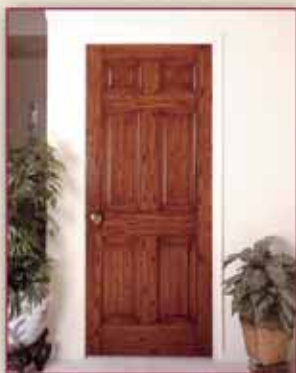
Steel door grained with ZAR® Wood Stain

Doors exposed to direct sunlight for prolonged periods should be protected with 3 coats of ZAR® Exterior Water-Based Polyurethane, ZAR® Exterior Polyurethane or ZAR® ULTRA Exterior Polyurethane.